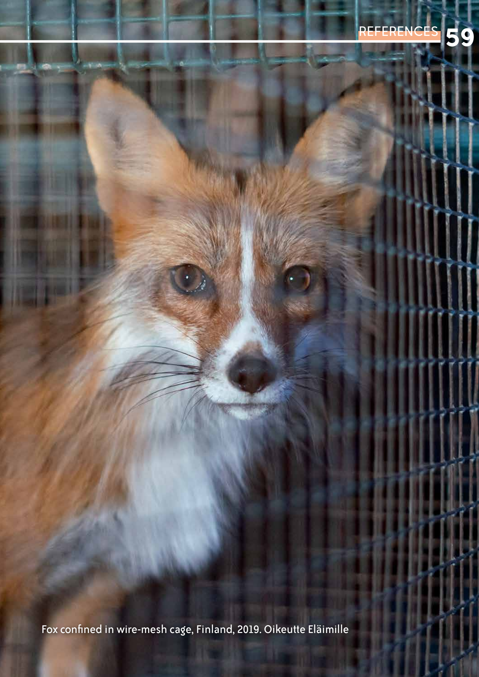
Fox confined in wire-mesh cage, Finland, 2019. Oikeutte Eläimille