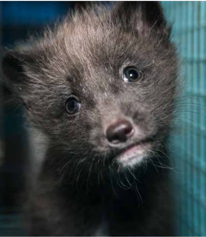
Fox cub in wire-mesh cage, Finland, 2019. Oikeutta Eläimille

Even where this is known to compromise welfare rather than encouraging the development of systems with the potential to provide a higher level of welfare. 2