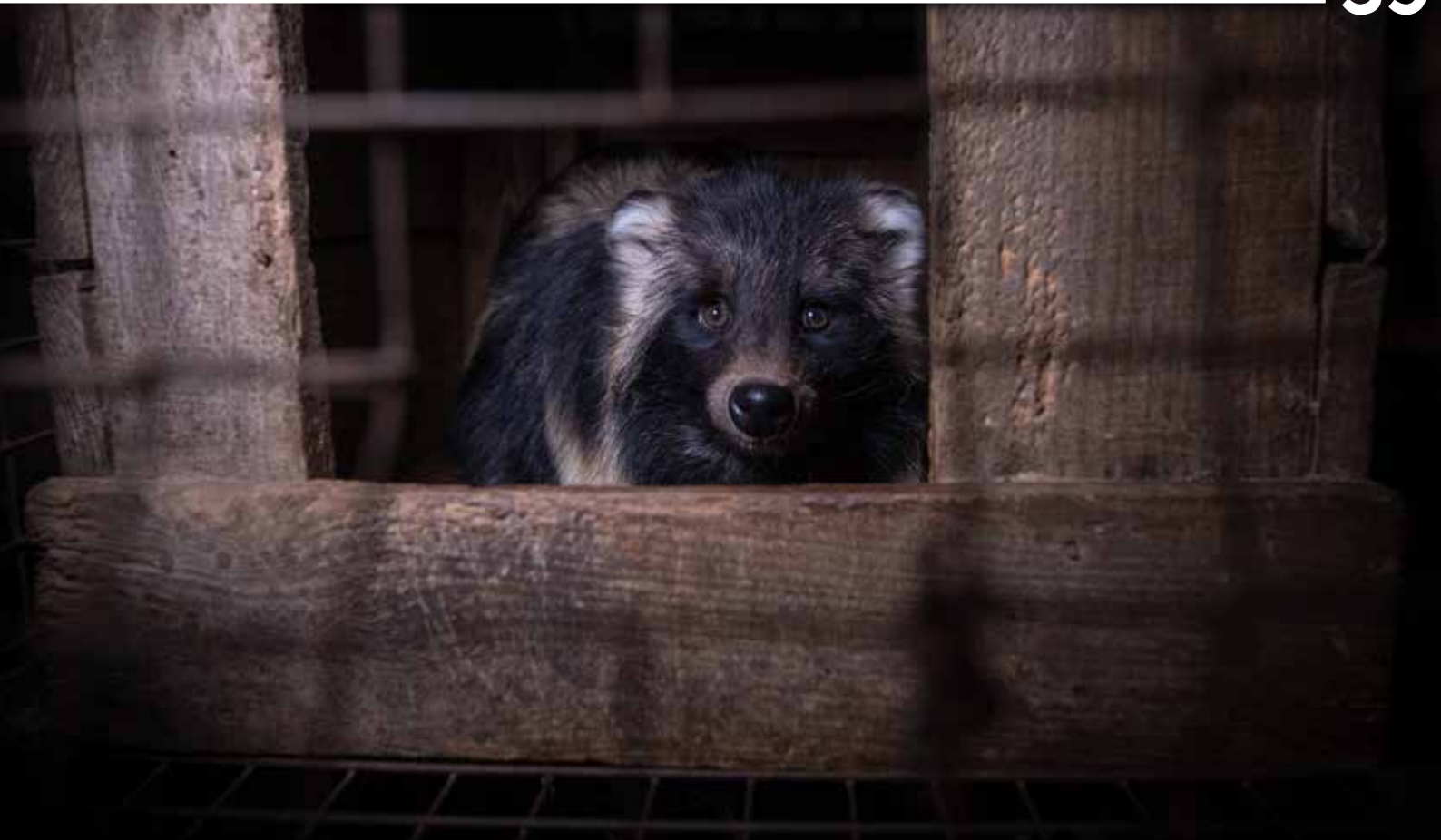
Raccoon dog in nest box on fur cage farm, Poland, 2019.