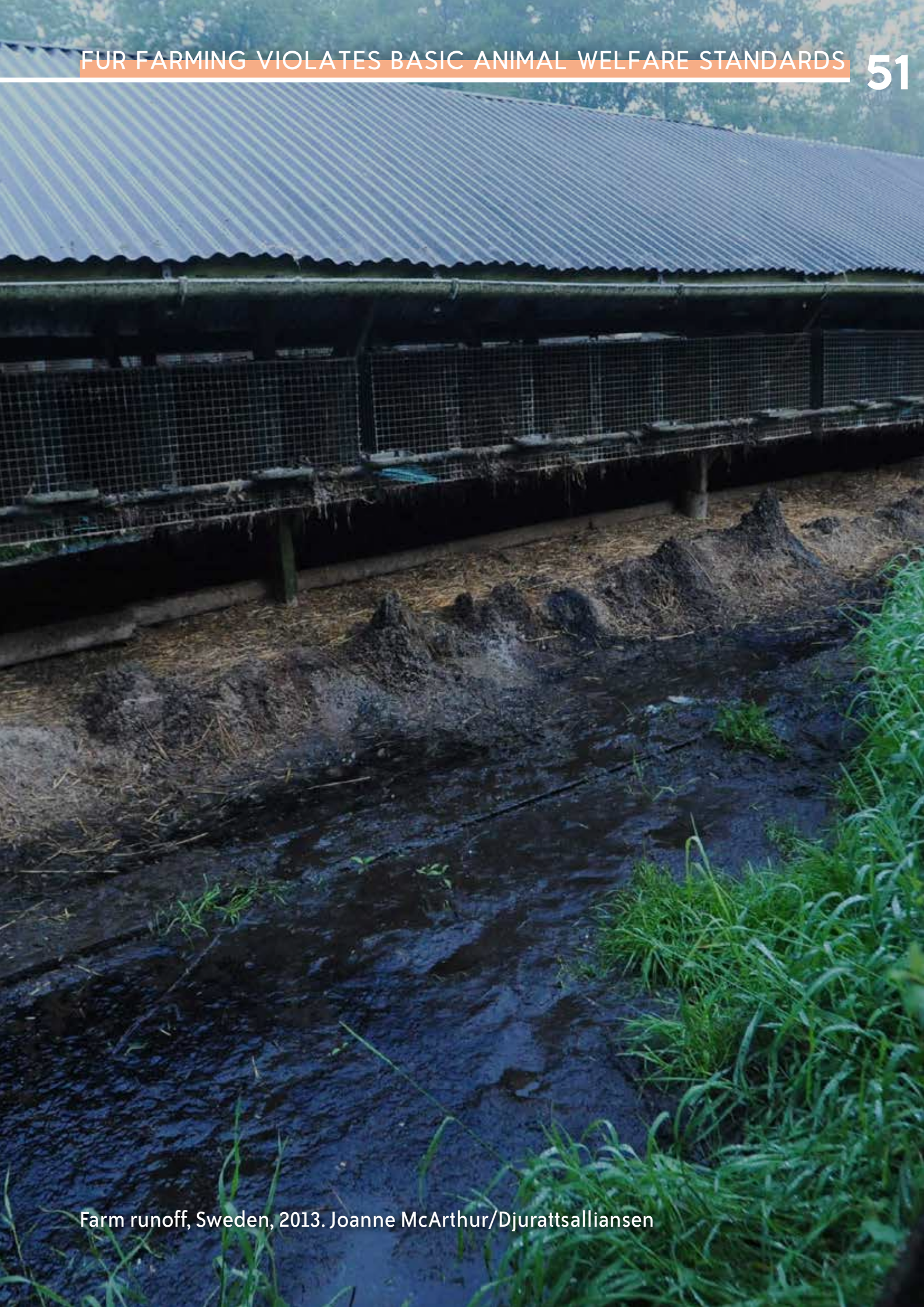
Farm runoff, Sweden, 2013.