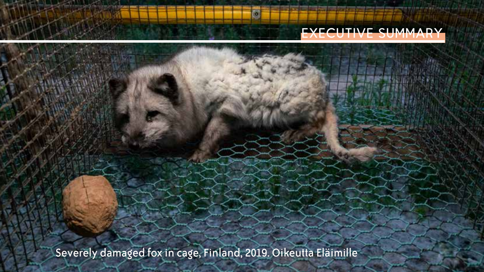
Severely damaged fox in cage, Finland, 2019. Oikeutta Eläimille