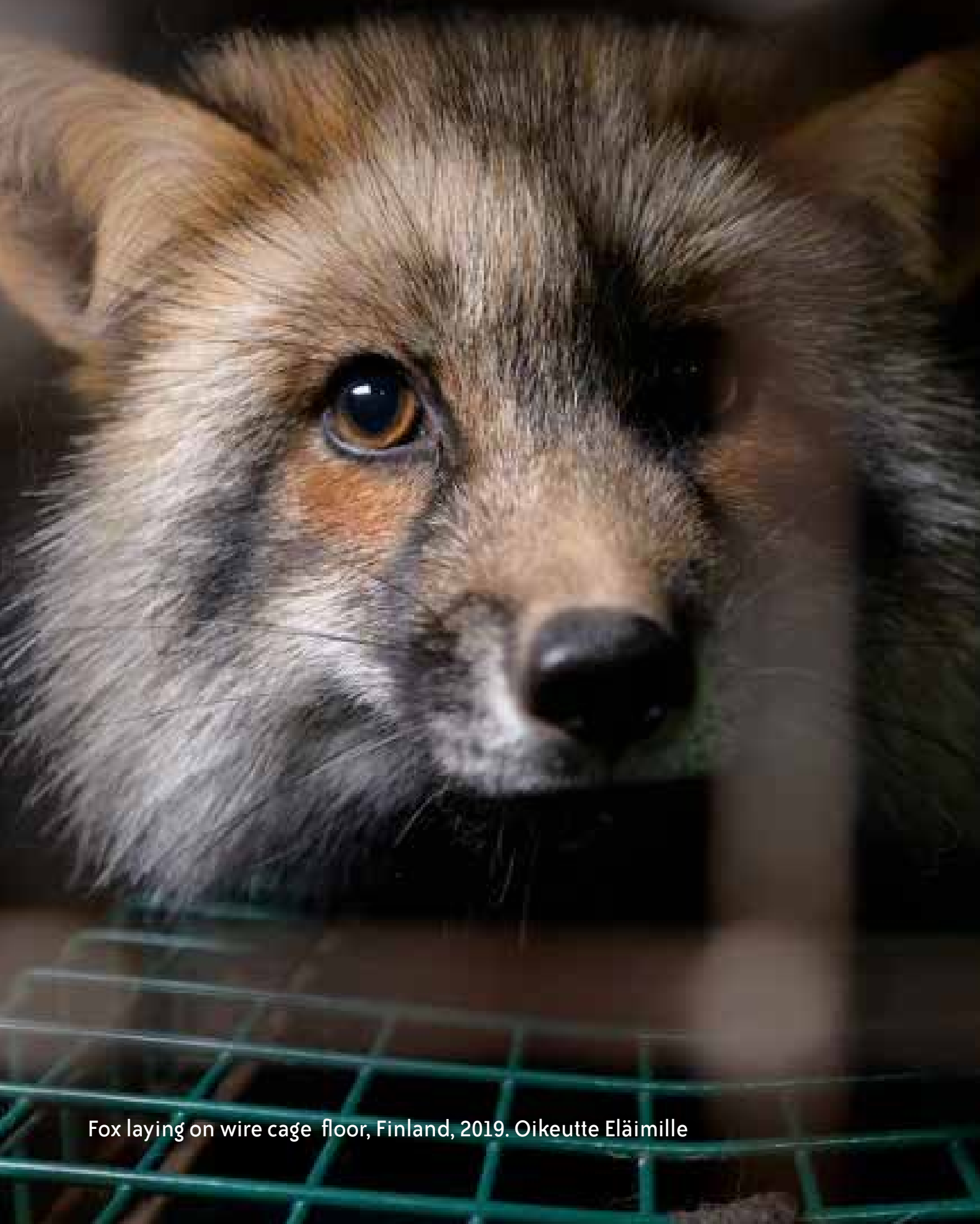
Fox laying on wire cage floor, Finland, 2019.