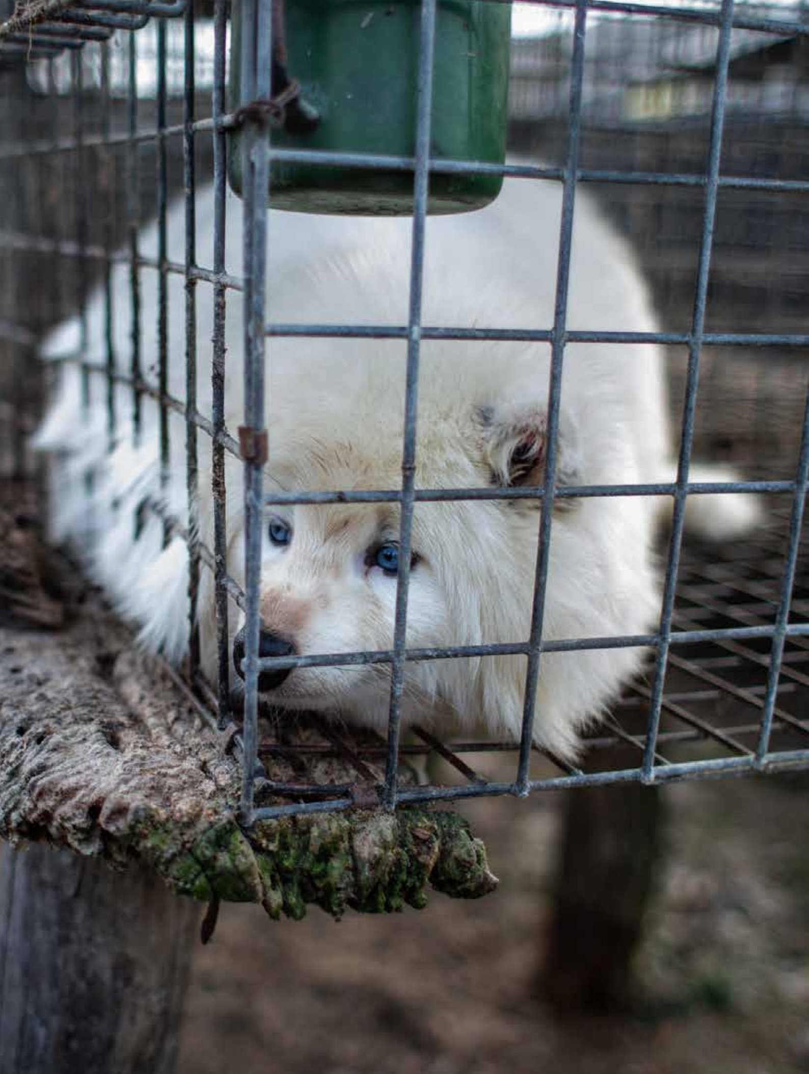
Raccoon dog in wire-mesh battery cage, Poland, 2019.