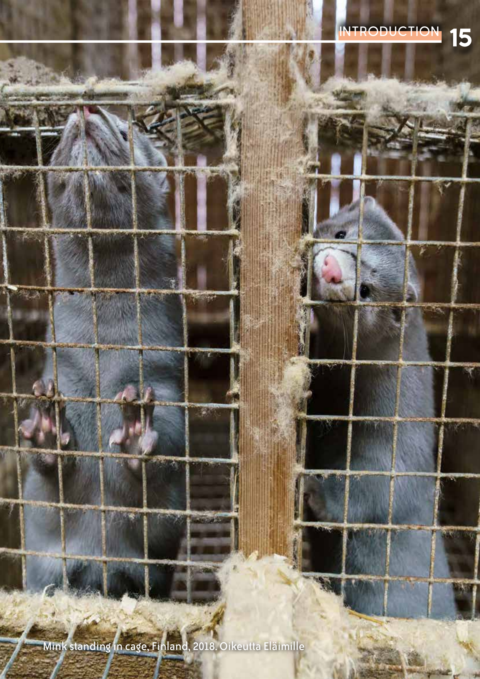
Mink standing in cage, Finland, 2018. Oikeutta Eläimille