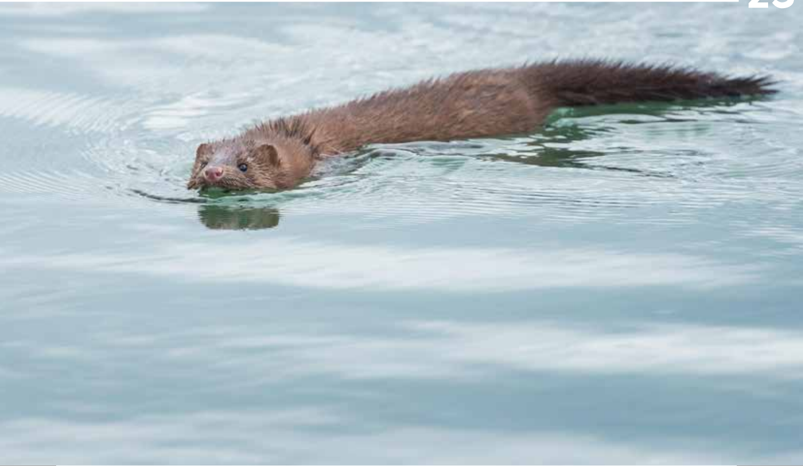
Wild mink swimming.

Fasola et al. (2009) in a later study could not find that the otter outcompeted the mink. Gerell (1967) found that wild mink in Sweden during wintertime usually consumed fish.