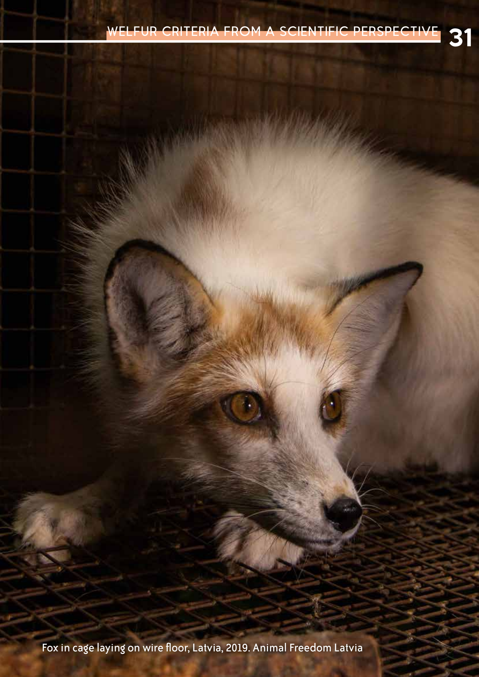
Fox in cage laying on wire floor, Latvia, 2019. Animal Freedom Latvia