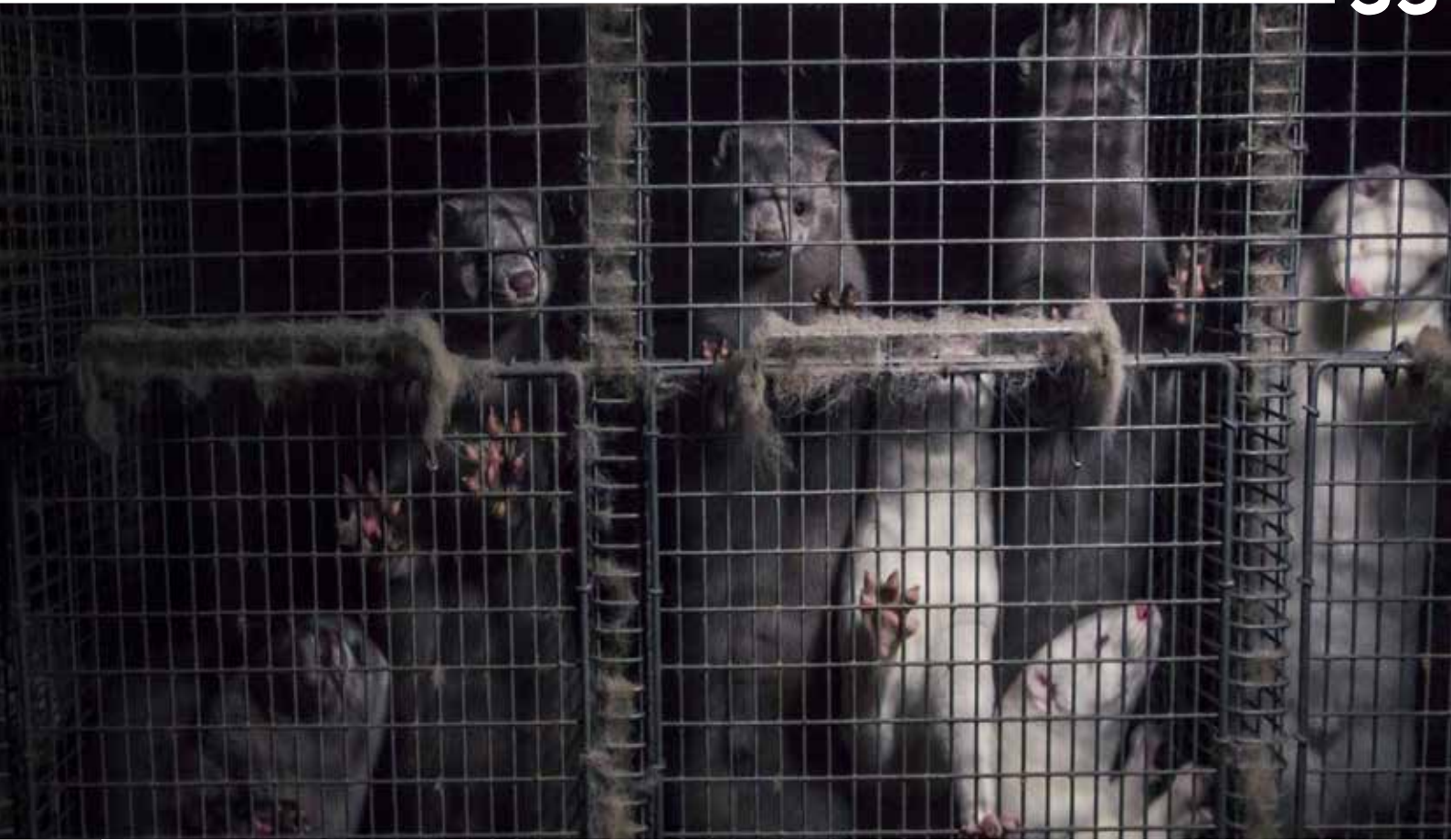
Mink housed together in battery cages, Finland, 2019. Oikeutta Eläimille

in many species, including primates, birds, and carnivores.