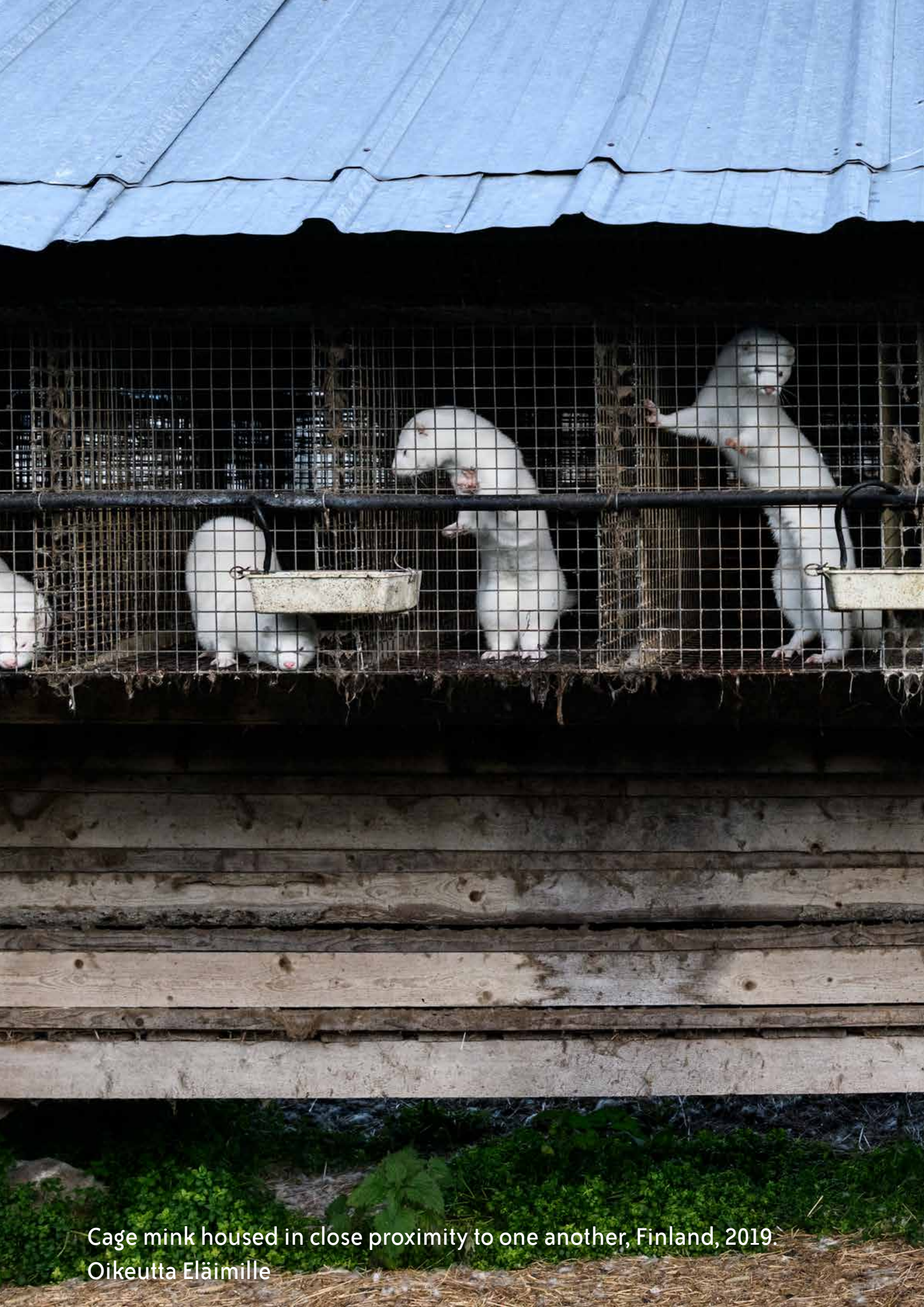
Cage mink housed in close proximity to one another, Finland, 2019. Oikeutta Eläimille