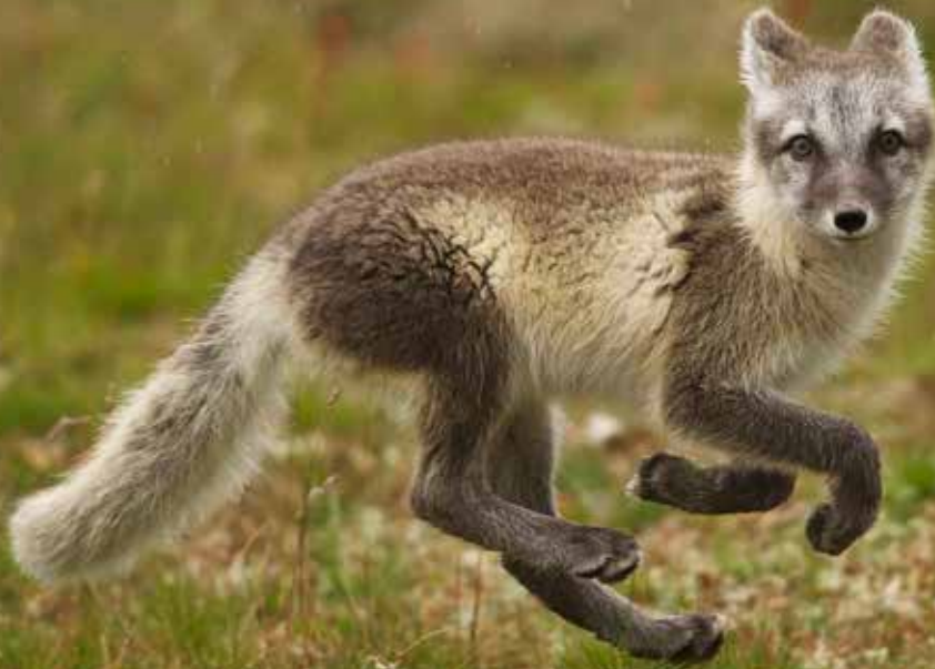
Wild Arctic fox.

The current situation of the knowledge of needs for farmed foxes to dig seem parallel to that of the knowledge of the need for sows to build farrowing nests in the early nineteen-eighties. In those years, it was assumed that the highly-domesticated sow did not even build farrowing nests. But research undertaken showed rapidly that sows, even with a previous experience of being crated for four consecutive farrowings without nest material, once released into semi natural enclosures, performed extensive nest building behaviours (Jensen, 1989) and other studies could confirm physiological traits that related to such behaviour (Algers & Uvnäs Moberg, 2007).