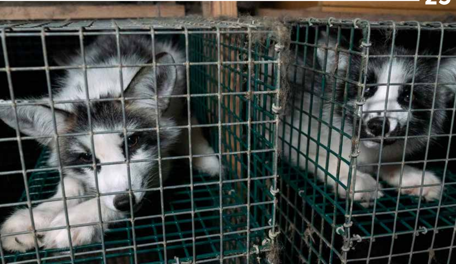
Two foxes housed next to each other laying on cage shelves, Finland, 2019. Oikeutta Eläimille

Ahola and Mononen (2002) monitored the behaviour of farmed silver foxes housed in family units in enlarged cage systems from weaning until late October. Activity of family members, use of space available, and aggressive acts were recorded. Aggressiveness between family members increased from July until October, leading to a more scattered use of the available space. Furthermore, the mean activity level of family members increased, and the synchrony of activity decreased. They concluded that social tension in the fox families increased gradually during the autumn, leading to dispersion of the family members.