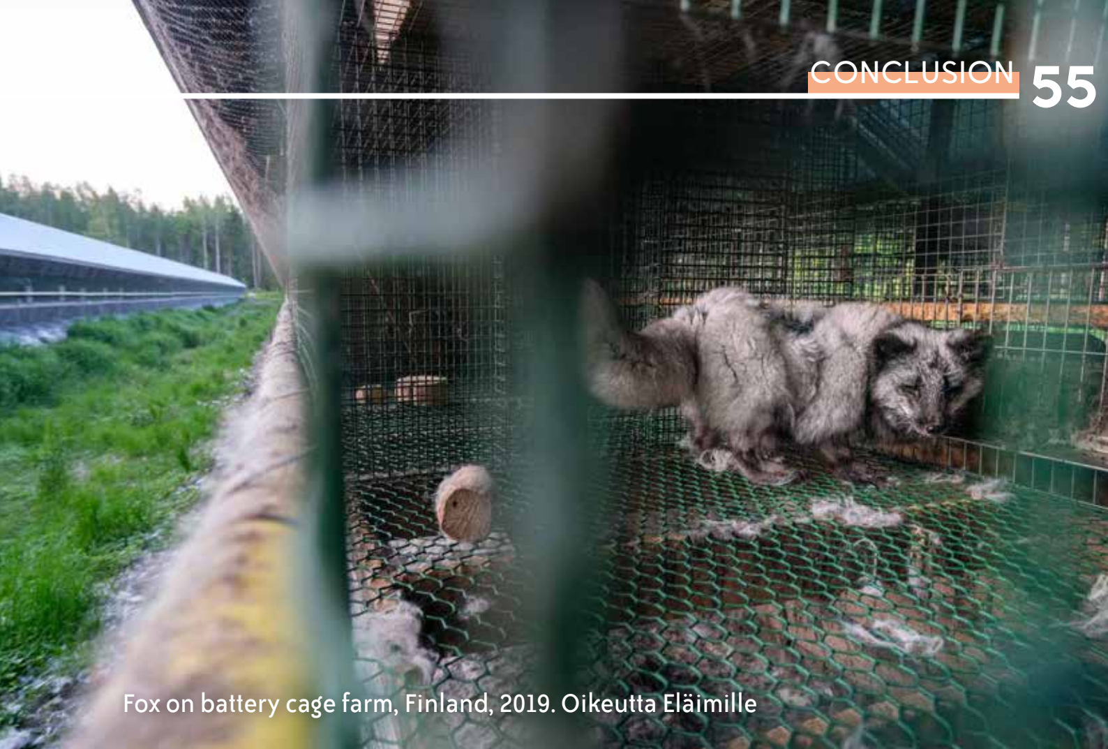
Fox on battery cage farm, Finland, 2019. Oikeutta Eläimille